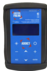
Commissioning and testing tool kit