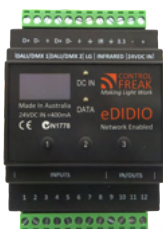
Controller / Translator / Gateway