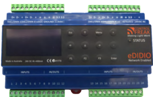
Controller / Translator / Gateway