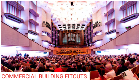
COMMERCIAL BUILDING FITOUTS