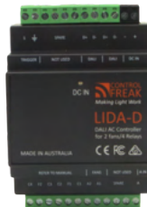
AC relay controller