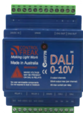
DALI 0-10V converter