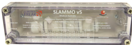
IP67 LED dimmer